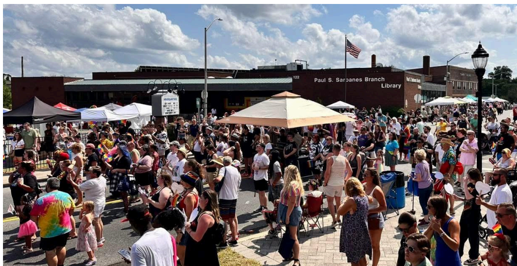
Attendees watch live performances at the festival in Downtown Salisbury.

June 29, 2024 - Salisbury Pride Parade and Festival - Salisbury, Wicomico County