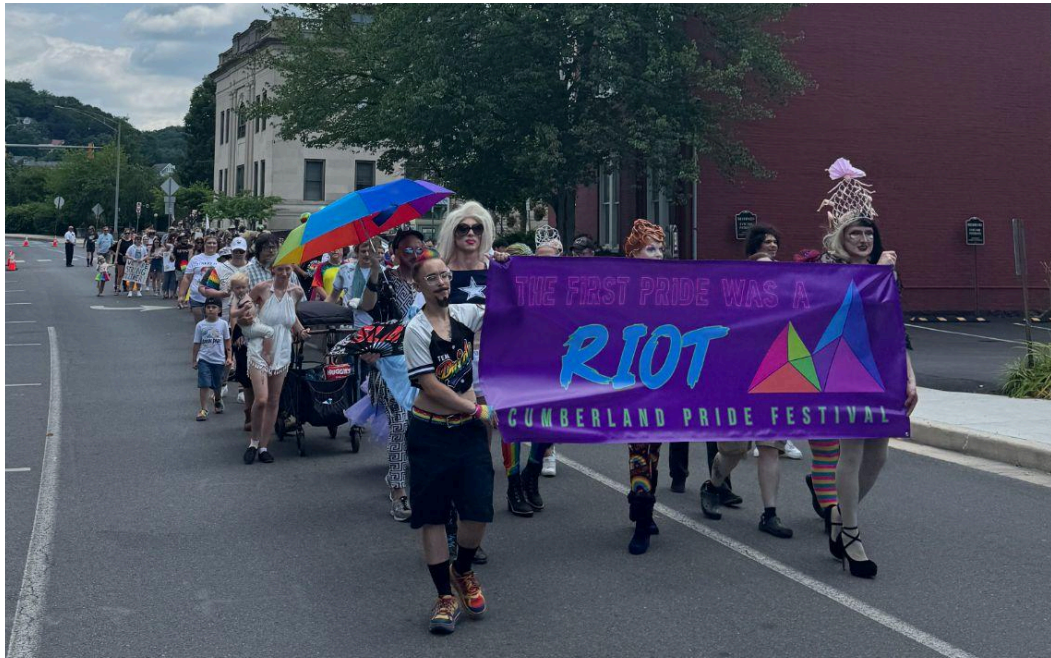
Photo: Cumberland Pride march to the festival grounds in Downtown Cumberland.