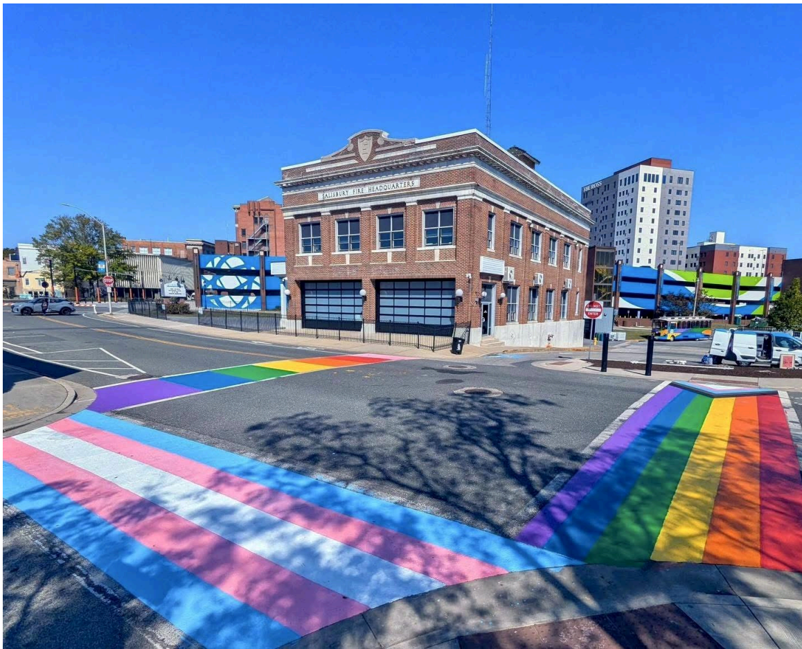
Maryland's first Pride and Trans Pride crosswalks in Salisbury, Maryland.