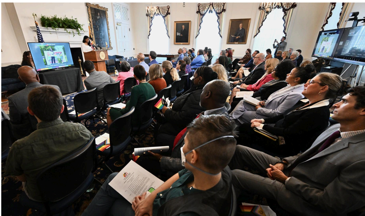
Lt. Governor Aruna Miller addresses symposium attendees.

October 24, 2024 - LGBTQIA+ Inclusion Symposium - Annapolis, Anne Arundel County