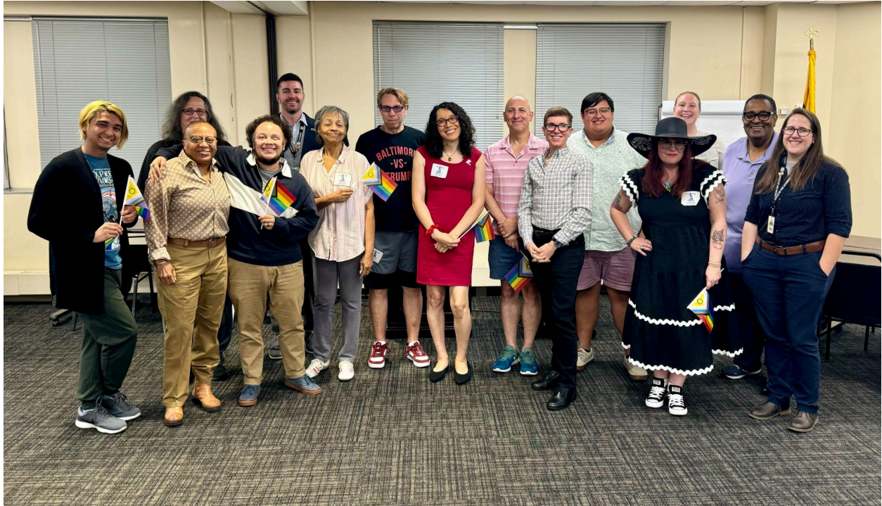
September 7, 2024 - Maryland Commission on LGBTQIA+ Affairs Strategic Planning Retreat - Crownsville, Anne Arundel County