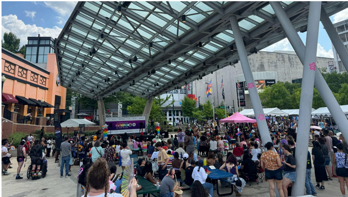
Attendees celebrate with live performances and speakers.