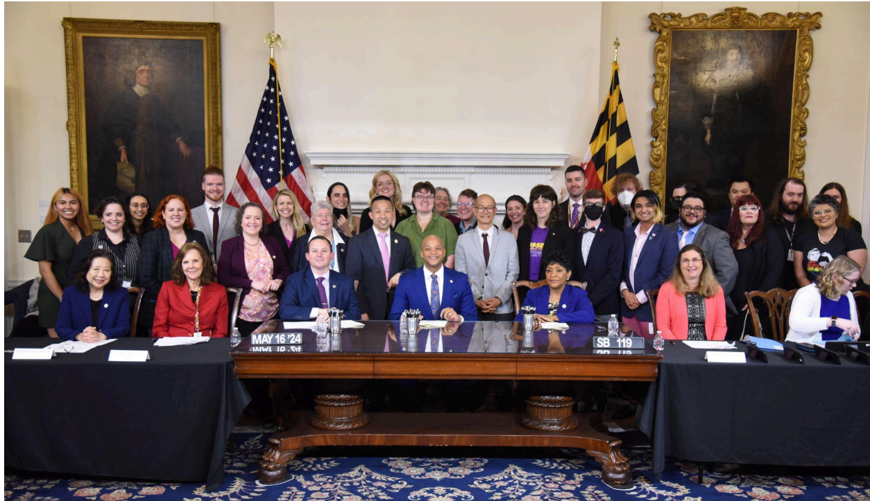
SB119 bill signing ceremony.

The 2024 legislative session marked continued progress in strengthening legal protections and public policy in support of LGBTQIA+ Marylanders. While several transformative bills advanced, others stalled despite widespread advocacy and strong community support. Overall, the session reflected both momentum and missed opportunities for equity.