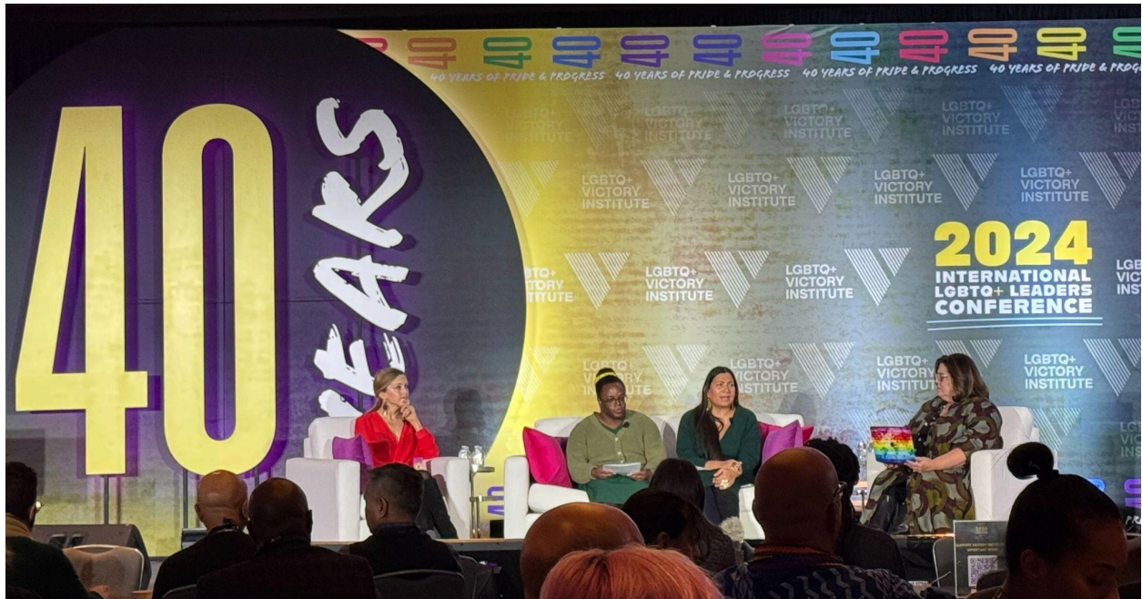
Photo: Panel discussion on intersex inclusion.

December 6, 2024 - Victory Fund 2024 International LGBTQ+ Leaders Conference - Washington, DC