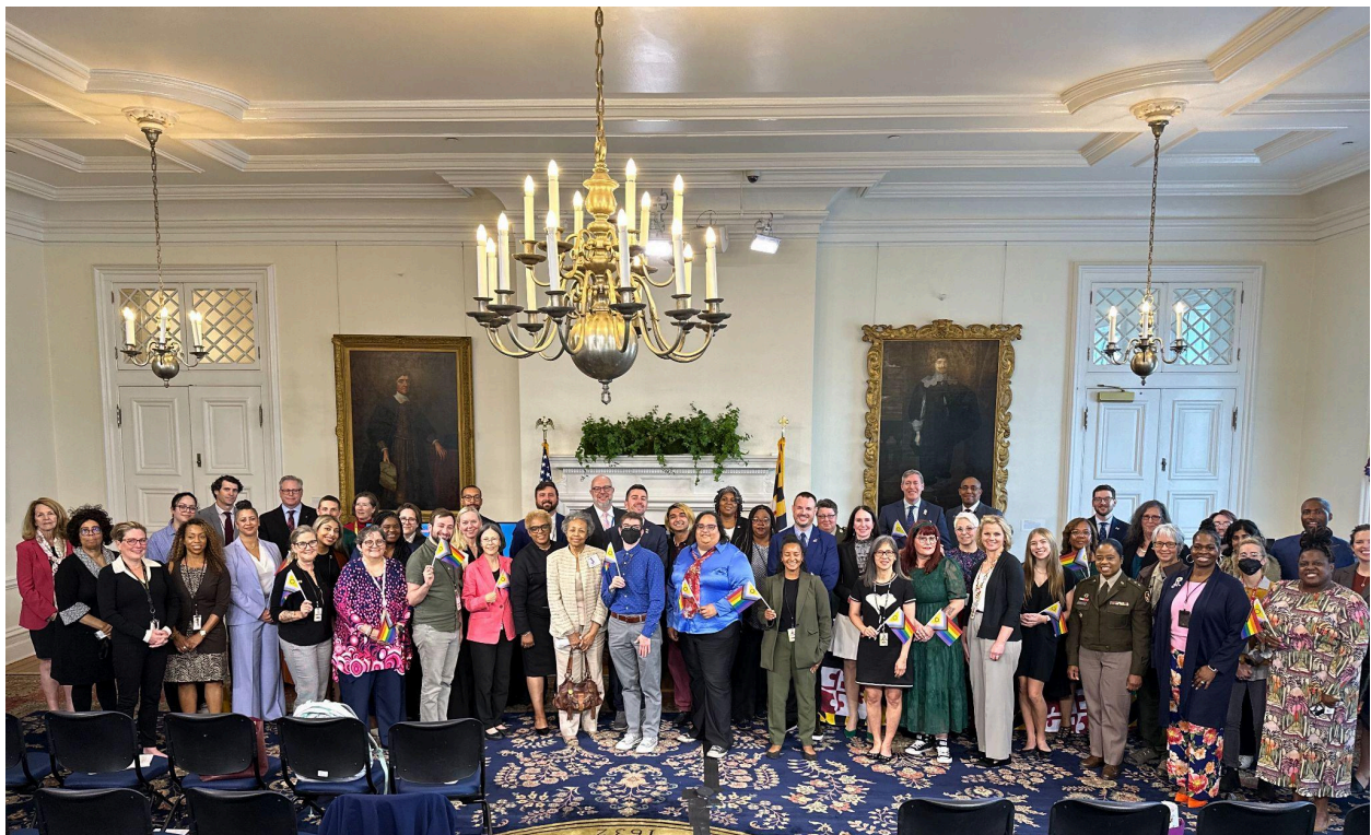
State agency leaders with commissioners and staff in the Governor's Reception Room following the symposium.

The Commission hosted its first-ever Statewide LGBTQIA+ Inclusion Symposium held on October 24, 2024 at the Maryland State House. Over 40 State agencies participated, reviewed Commission recommendations and best practices, shared progress through case studies, built connections, and networked. The event equipped State agency leaders with the knowledge and tools necessary to foster inclusive environments for LGBTQIA+ employees and constituents.