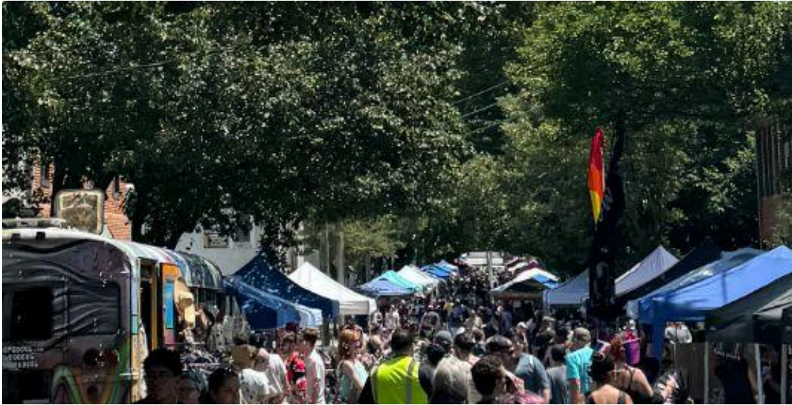
Photo: Hundreds of festival attendees line the streets in Downtown Westminster.

July 13, 2024 - Westminster Pride - Westminster, Carroll County