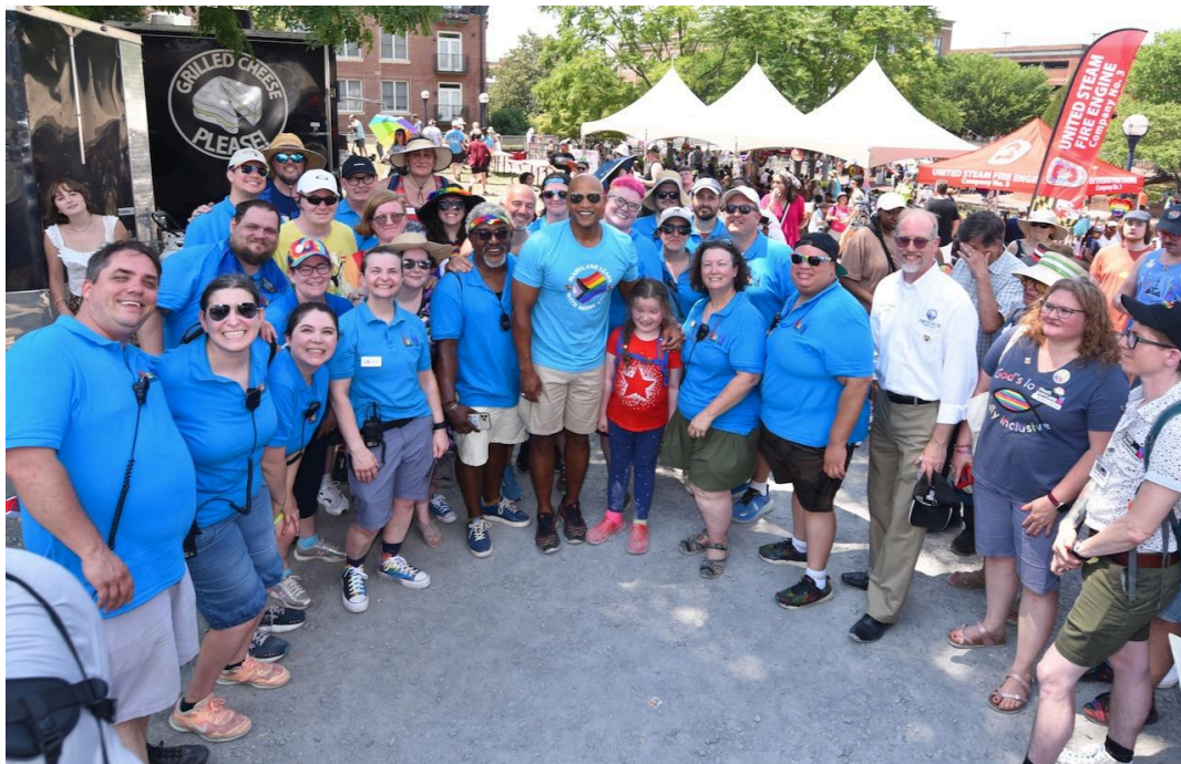
Frederick Pride staff, volunteers, commissioners, and festival attendees with Governor Moore