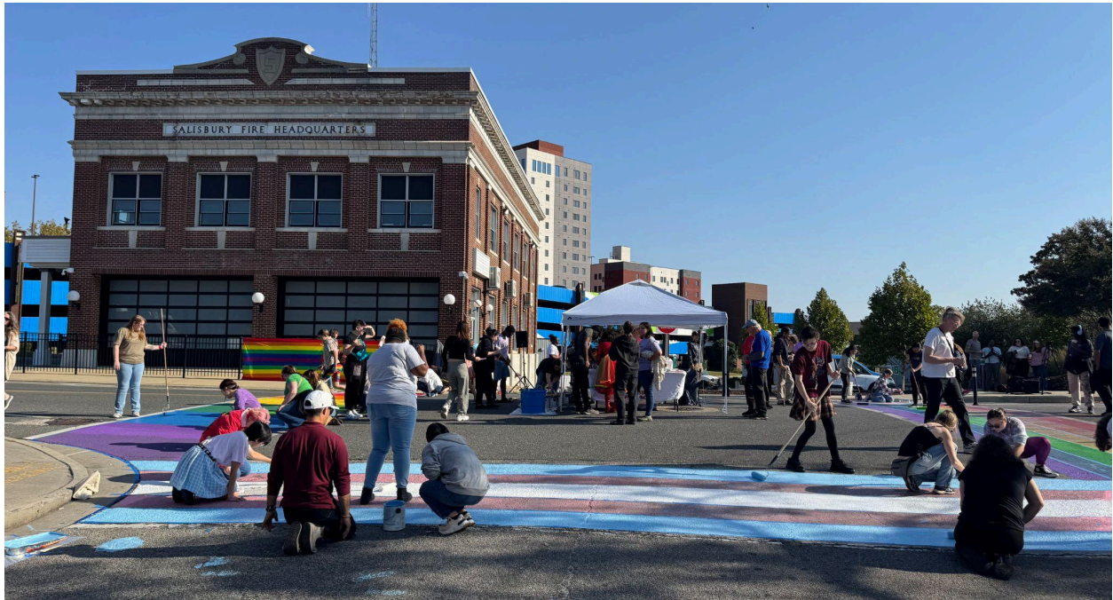
Photo: Volunteers repaint the crosswalks in front of Salisbury City Hall. Salisbury is the first city in Maryland to install Pride and Trans Pride crosswalks which are now slated for removal by the current Salisbury mayor.