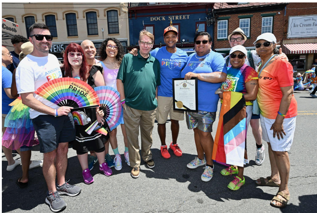
Commissioners with Governor Moore before the Annapolis Pride Parade