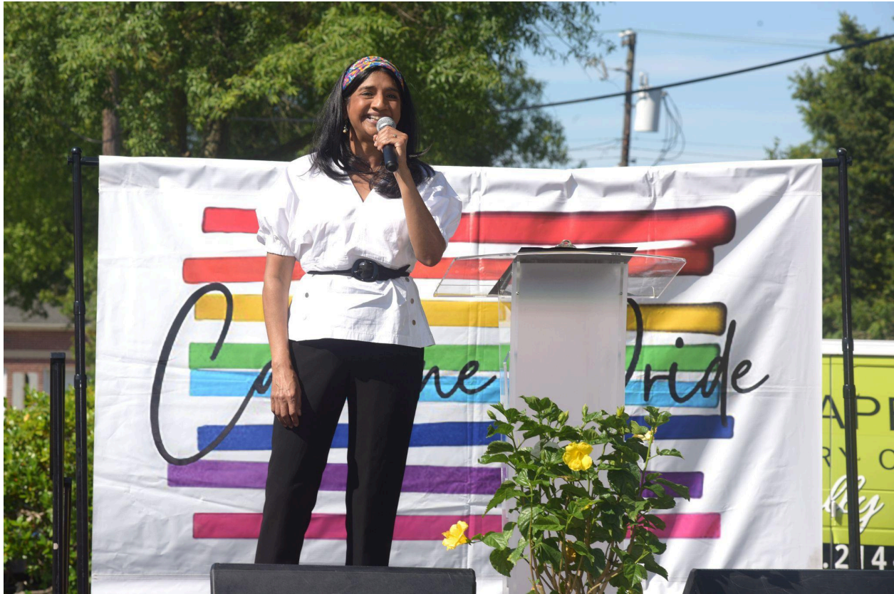
Lt. Governor Aruna Miller addresses festival goers.

June 1, 2024 - Caroline County Pride - Denton, Caroline County