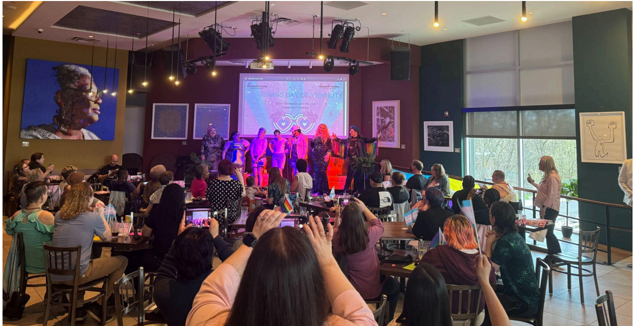
Photo: Performers take the stage at Bus Boys & Poets.