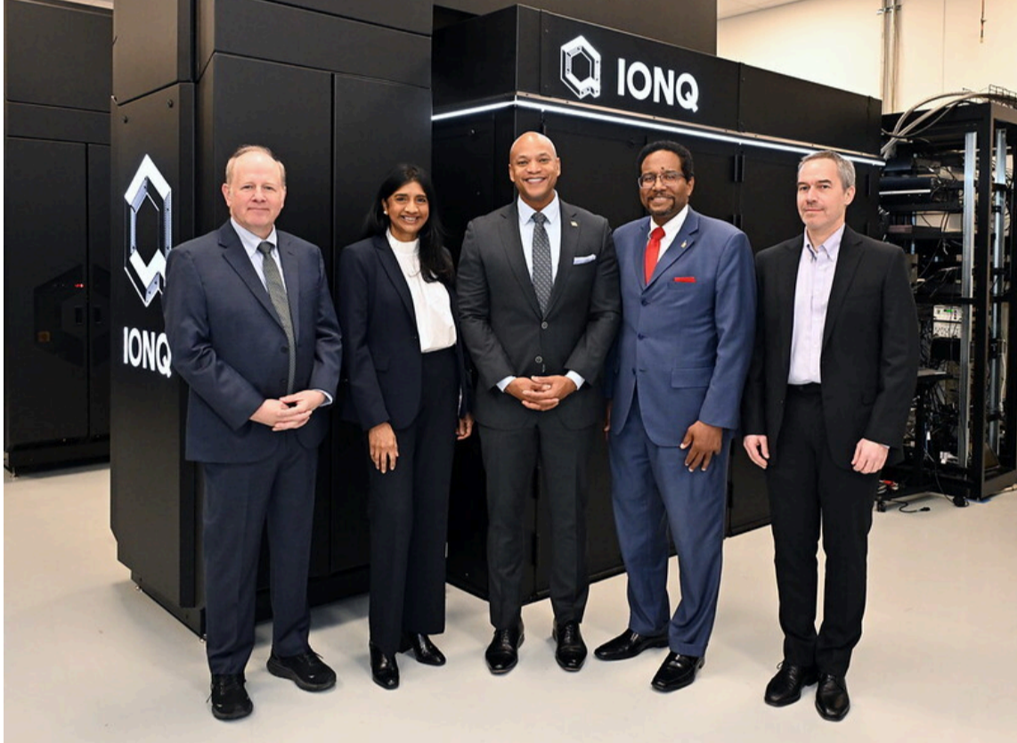
Governor Moore and I visited the IonQ HQ in College Park to announce our economic growth agenda that includes investing in industries of the future like quantum.

You can learn more about the Moore Miller Administration's FY2026 Budget Highlights here. If you would like to know greater details about the Operating Budget and Capital Budget, please visit A Citizen's Guide to the Budget .