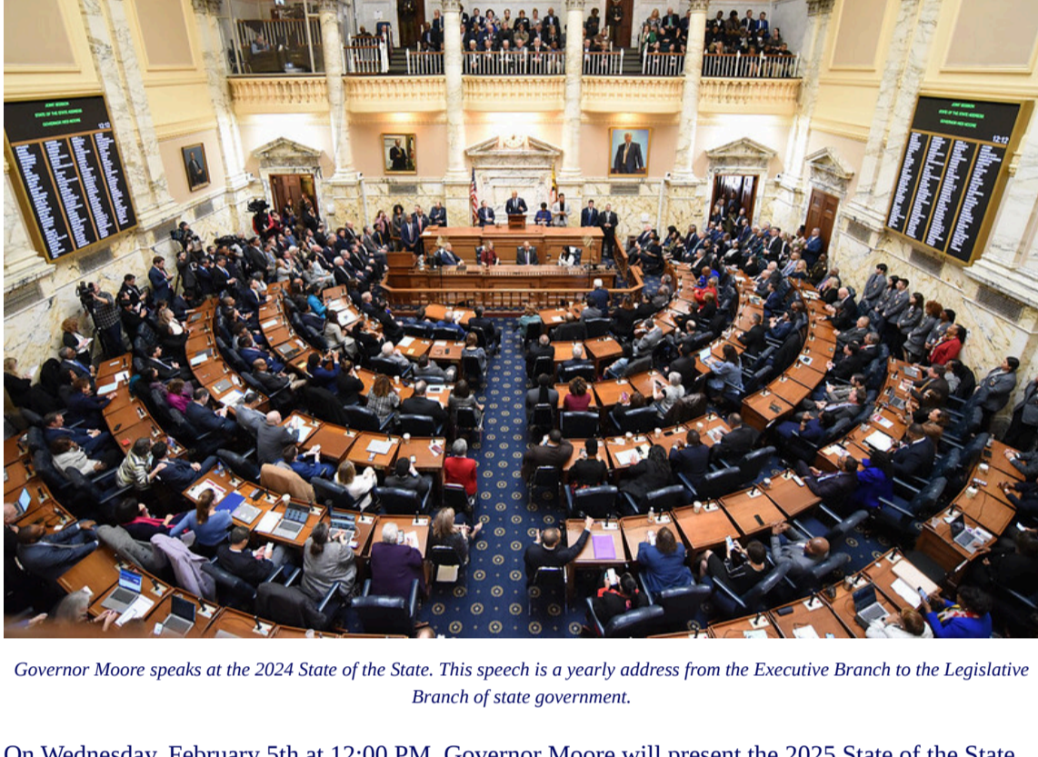
Governor Moore speaks at the 2024 State of the State. This speech is a jointly address from the Executive Branch to the Legislative Branch of state government.

On Wednesday, February 5th at 12:00 PM, Governor Moore will present the 2025 State of the State Address. In his remarks, he will discuss the Moore-Miller Administration budget proposals and outline our legislative priorities for the upcoming session.