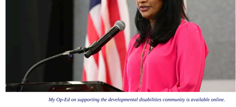
My Op-Ed on supporting the developmental disabilities community is available online.

This week I penned an Op-Ed in the Capital Gazette on a topic that is particularly close to my heart.