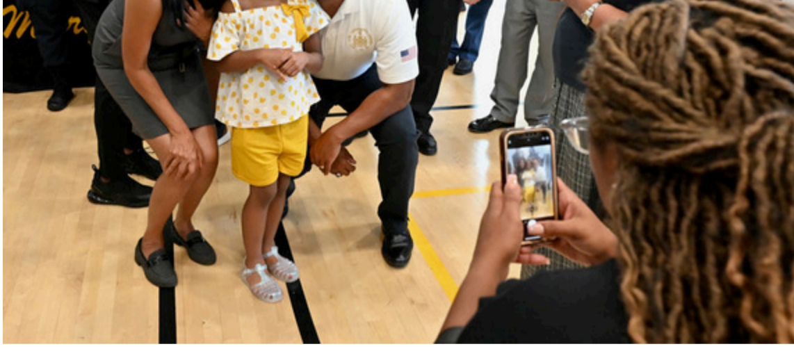
Governor Moore embodies the spirit of possibility and inspires the next generation of Marylanders.

Black History Month honors the resilience, brilliance, and contributions of Black Americans who have shaped our nation's progress. Here in Maryland, history is not just something we reflect on—it is something we are making. Wes Moore, our state's first Black governor, embodies the spirit of possibility, proving that barriers are meant to be broken and that leadership through service creates lasting change. Serving alongside Governor Moore for the people of Maryland has been the honor of a lifetime - a privilege that fills me with gratitude every day.